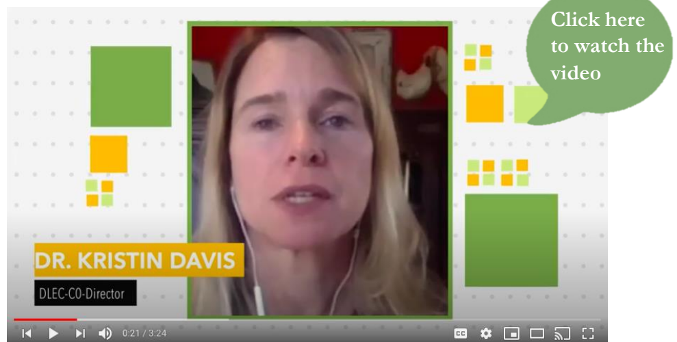
Video 5: Recommendations

Specific types of institutions that can take action on the recommendations are included in parentheses with each recommendation. Types of institutions include governments, donor agencies, and implementers (which include government agencies, NGOs, private companies and farmers' organizations).