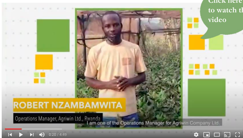
Video 2: Youth-led, fee-based extension services

The Youth Engagement in Agriculture Network (YEAN), founded in 2014, had 12,000 members in Rwanda who access information through their phones, YEAN’s website and Facebook and WhatsApp groups. YEAN also had a network of 60 volunteer youth community coordinators, two per district, to assist members and the public in accessing information. The community coordinators provided advisory services to farmers and cooperatives on a fee basis. YEAN’s other extension activities included partnering with Go Ltd to develop digital agricultural content and with the NGO Access Agriculture to translate agricultural videos for Rwandan farmers (YEAN, 2020).