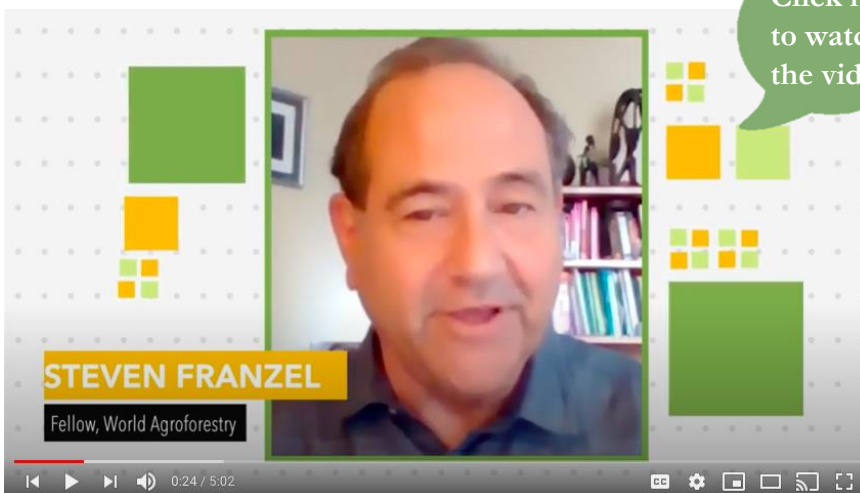
Video 1: Key findings

Seven models that involve youth in EAS as both providers and recipients of extension were identified and are listed below. All models were pluralistic, involving government, private sector and NGOs. The private sector led and was the main funder in the village agent model. In the other models the leaders and sources of funding varied and included government, private sector, NGOs, CBOs, educational institutions and donor agencies.