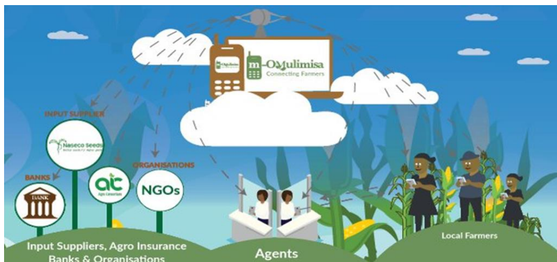
Figure 2: Village agent model as implemented by m-Omulimisa, a Ugandan company

Village agents (VAs) linked farmers to input suppliers, produce buyers and other service providers (Figure 2). In some cases, they worked directly for these service providers and in other cases they were employed by NGOs, development projects or private companies specializing in linking farmers to service providers. In some cases, village agents advised farmers on a range of agricultural topics but in other cases they only assisted farmers to make calculations of their farm input needs using smartphones. Most village agents were paid by commission for sales of inputs or for brokering or aggregating products. Others received salaries.